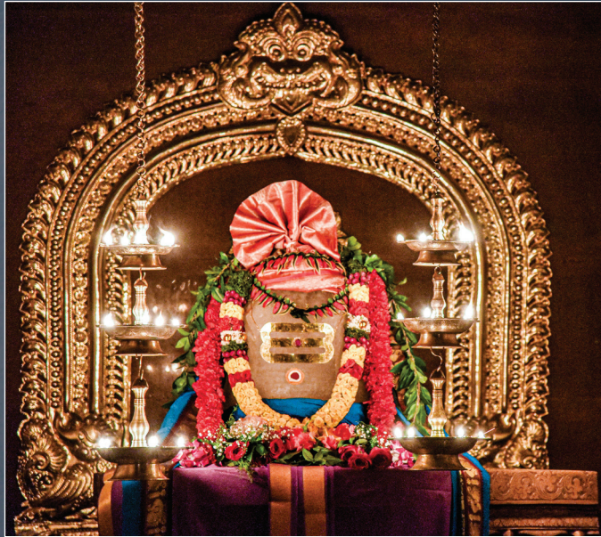
The 700-pound crystal Sivalingam in Iraivan Temple, decorated with flower garlands after puja rites have been conducted

Chanting and satsanga and ceremonial rituals all contribute to this sanctifying process, creating an atmosphere to which the Gods are drawn and in which they can manifest. By the word manifest , I mean they actually come and dwell there and can stay for periods of time, providing the vibration is kept pure and undisturbed. The altar takes on a certain power. In our religion there are altars in temples all over the world inhabited by the