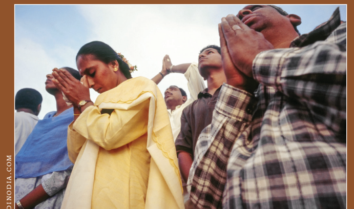
Devotees offer prayers in a temple in Bengaluru, Karnataka

He brings another prayer to the Gods, and again in time an answer appears in the natural course of his life. It appears to him that the Gods are hearing and responding to his needs. Trust and love have taken root. He goes on, year after year, bringing the Gods into his secular affairs, while just as carefully the Gods are bringing him into their celestial spheres, enlivening his soul with energy, joy and intelligence.