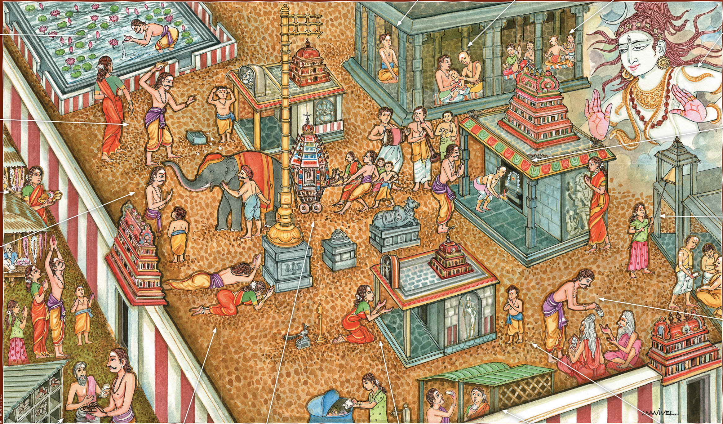
A man bathes and worships at the temple tank as an act of purification.

This mural depicts typical activities in the precincts of a large temple, such as one would find in South India.