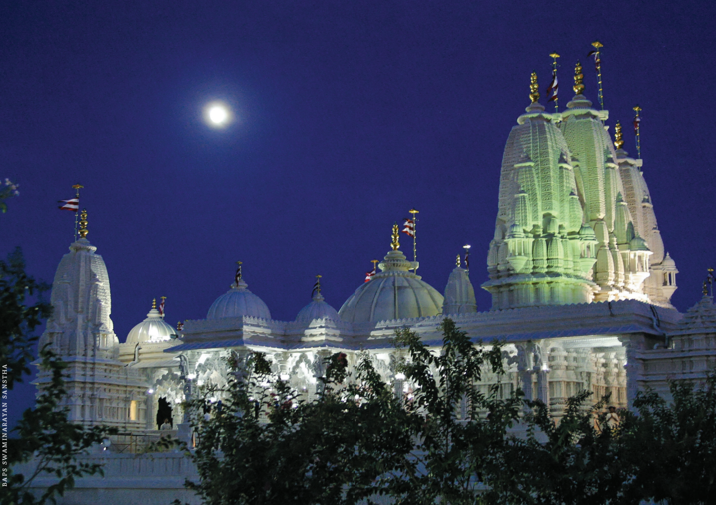
BAPS SWAMINARAYAN SANSTHA

Hereditary temple architects, known as sthapatis , are commissioned to design and construct the temple according to the sacred architecture found in the Agamic scriptures. Consecration occurs through the powerful ceremony of kumbhabhishekam , with many priests performing elaborate rituals for several days. Then begins the perpetual schedule of obligatory pujas conducted by highly trained priests. These daily pujas sustain and build on the power set in motion at the kumbhabhishekam .