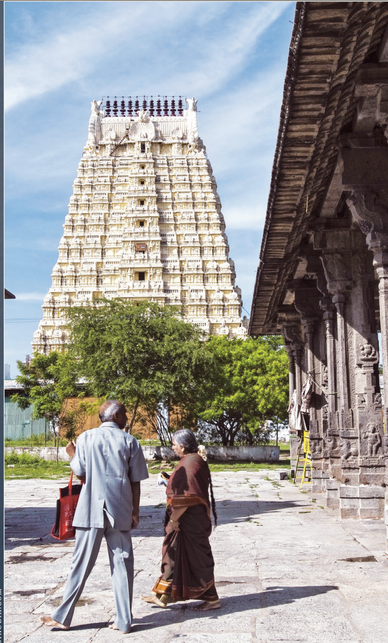
A couple walk barefoot in the precincts of the Sri Ekambaranathar Siva temple in Kanchipuram, Tamil Nadu

him, helping and guiding his entire evolutionary pattern. Darshan coming from the great temples of our Gods can change the patterns of karma dating back many past lives, clearing and clarifying conditions that were created hundreds of years ago and are but seeds now, waiting to manifest in the future. Through the grace of the Gods, those seeds can be removed if the manifestation in the future would not enhance the evolution of the soul.