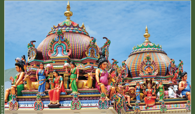
Denizens of the three worlds are often depicted, as here, on a temple's ornate towers

The reality of the Mahadevas and their darshan can be experienced by the devotee through his awakened ajna