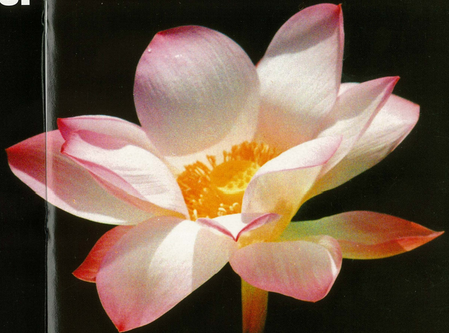
Seed, bud and bloom: A seed-pod (left), young bud and mature blossom of the sacred lotus, Nelumbo nucifera

B OTH IN WORSHIP AND IN PORTRAYALS OF THE DIVINE, HINDUS ARE INFATUATED WITH FLOWERS. The very name of the Hindu worship ritual, puja , can be translated as “flower act.” Elaborate and simple garlands, fragrant whole flowers and piles of petals daily rain over Deities in temple, home and village shrines wherever Hindus worship. Though any available flower is auspicious for puja , Gods and Goddesses are said to have specific likes and dislikes of certain species. Of all the myriad buds and blooms, the most revered and esteemed—by God and man—is the magnificent lotus. Our tribute to this blessed blossom is given by Anil K. Goel of the National Botanical Research Foundation, Lucknow, India.