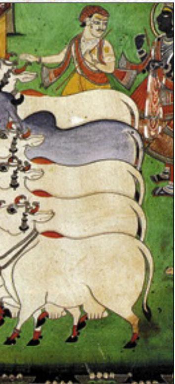
ASIA SOCIETY GALLERIES