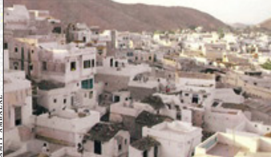
Nathdwara: The lineage's central city, in Rajasthan

When Sri Vallabhacharya was 52 years old, Sri Krishna requested him to return to His abode. The acharya retired to Banaras. After several weeks, he called his sons there to give them his final teachings. He silently wrote his teachings in the sandy banks of the Ganga: "If you ever turn your back on Sri Krishna, this age of struggle will consume your body, mind and consciousness." Then Lord Krishna appeared and gave the blessing that He would look after all the faithful followers. Sri Vallabhacharya entered the Ganga, singing the "Gopi Gita," the Song of the Gopis. In the presence of thousands of people, he merged into the divine fire from which he once appeared. He entered the lila with his body and left us with the auspicious message: to remain before the Blessed Lord and live gracefully in the world.