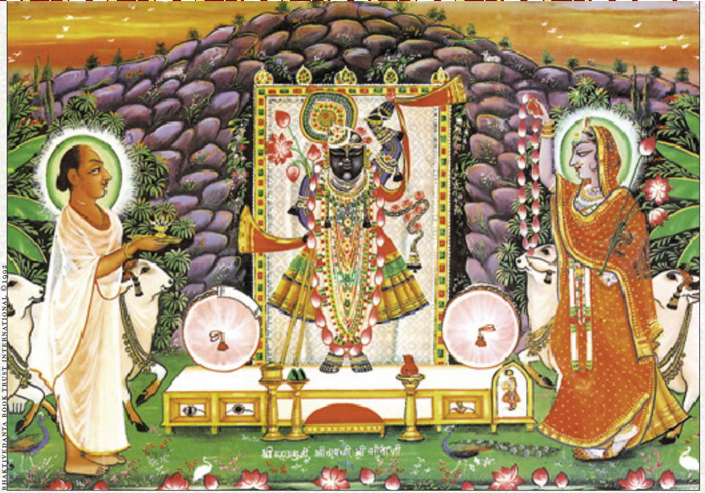
At Vrindavan: Sri Vallabhacharya (1479–1531) offers lamp to his Lord, Sri Nathji as Goddess Yamunaji lifts lotus garland